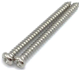
2 EA x Screw